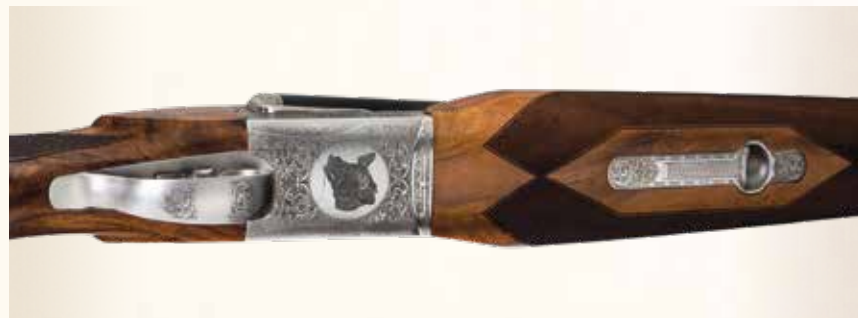
The Chapuis X4 is built on a Progress 28-gauge scalloped receiver, beautifully engraved. Shown here is one of the many versions they have made, embellished with a European wild boar.

Pick up a Chapuis X4 double rifle and you'll feel like you are holding a little jewel. Built on a sub-gauge shotgun action and sporting lightweight 22" barrels, the X4 is perfect for the hunter looking for a quick-handling, light and trim double rifle. Originally conceived for European-style driven game, this big rifle in a small package is offered in the hard-hitting 9.3x74R and the versatile .30-06 chamberings.