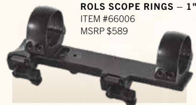
ROLS SCOPE RINGS – 1" ITEM #66006 MSRP $589