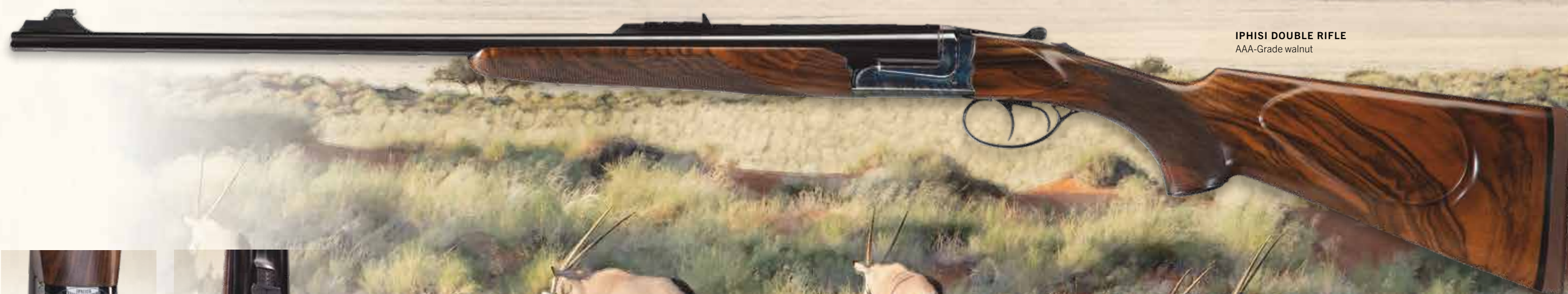
IPHISI DOUBLE RIFLE AAA-Grade walnut