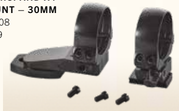
ELAN, IPHISI AND X4 RINGMOUNT – 30MM ITEM #66008 MSRP $589