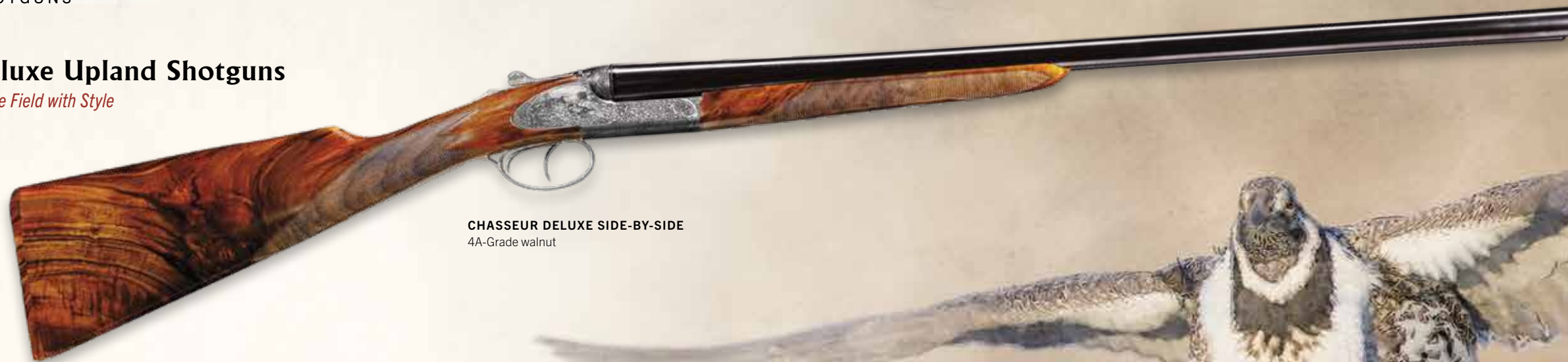
CHASSEUR DELUXE SIDE-BY-SIDE 4A-Grade walnut