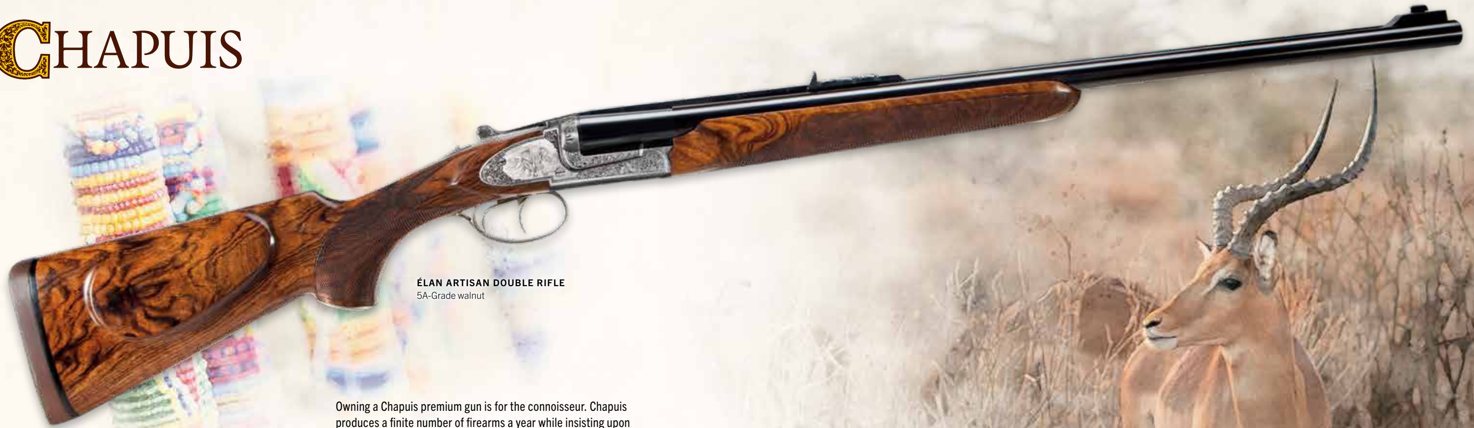
ÉLAN ARTISAN DOUBLE RIFLE 5A-Grade walnut