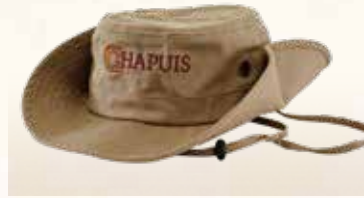
CHAPUIS LOGO HAT TAN – ONE SIZE ITEM #91309 MSRP $39