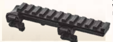
ROLS WEAVER PROFILE BASE ITEM #66013 MSRP $589