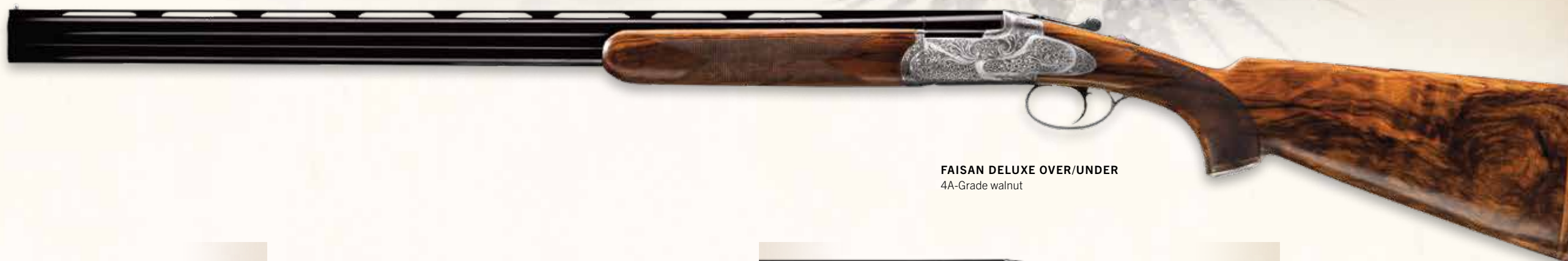
FAISAN DELUXE OVER/UNDER 4A-Grade walnut