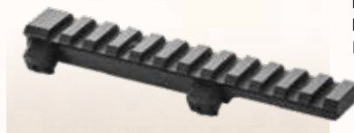
ROLS PICATINNY RAIL ITEM #66024 MSRP $269