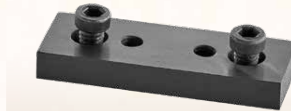
BLANK IN PLACE OF SIGHTS ITEM #66032 - 375 MSRP $69 ITEM #66037 - 450-400 MSRP $69 ITEM #66038 - 470 MSRP $69

A base for the Acro red-dot mount, to be installed in the forward scope mounting slot.