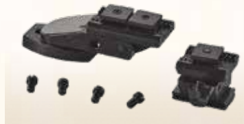
ÉLAN & IPHISI QD PIVOT MOUNT SWAROVSKI RAIL ITEM #66009 MSRP $769