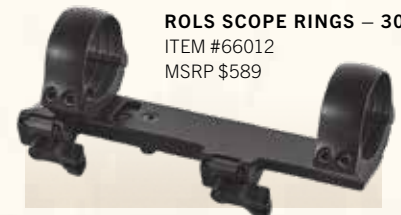
ROLS SCOPE RINGS – 30MM ITEM #66012 MSRP $589