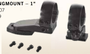
ELAN, IPHISI AND X4 QD PIVOT RINGMOUNT – 1" ITEM #66007 MSRP $589

Talley Rings for Iphisi Available directly from Talley. We recommend SKUs CCH100005 (high, 1") or CCH300005 (high, 30mm).