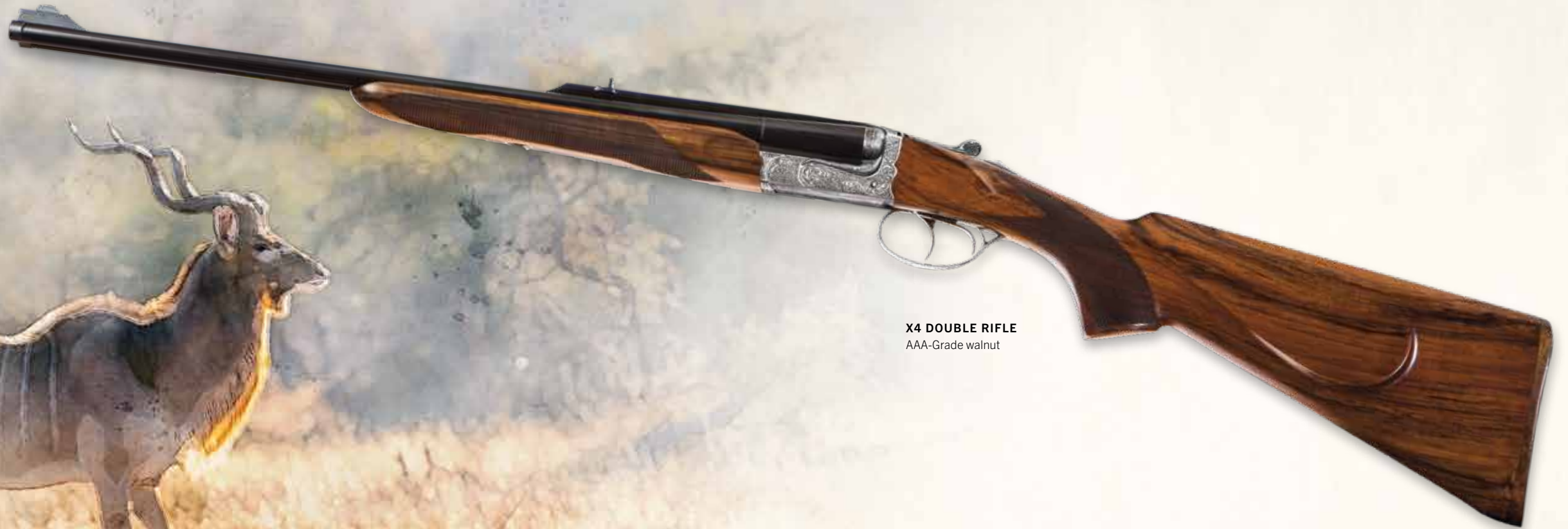
X4 DOUBLE RIFLE AAA-Grade walnut

A Trim, Petite Double Rifle giving Easy Re-regulation