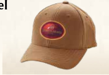
CHAPUIS LOGO HAT TAN – ONE SIZE ITEM #91275 MSRP $25